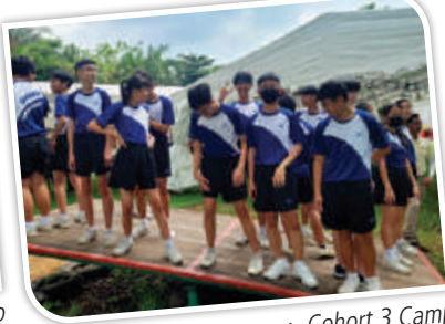
▲ Cohort 3 Camp