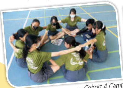
▲ Cohort 4 Camp

The Cohort 1 and 3 students participated in a residential camp at MOE Labrador Outdoor Adventure Centre and Camp Challenge Sentosa respectively. Students had the opportunity to try out a wide variety of exciting activities which included low and high elements, abseiling, rock climbing and outdoor cooking. The Cohort 2 students attended a 3-day non-residential camp and had fun participating in outdoor activities such as kayaking at Lower Seletar Reservoir and Amazing Race at Sembawang Park. Our graduating cohort attended a motivation camp in school to experience and learn vital study skills for their upcoming national exams.