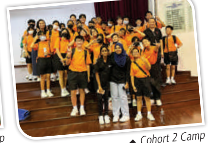
▲ Cohort 2 Camp