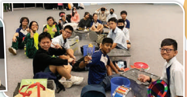
▲ Students getting ready for the auditions excitedly!