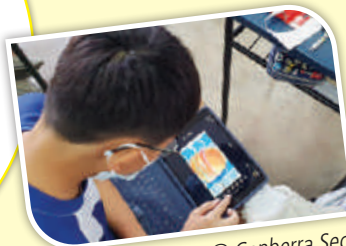
▲ Applied Learning @ Canberra Sec

The Cohort 1 Visual Art curriculum looks into preparing students with visual aesthetics and digital media skills.