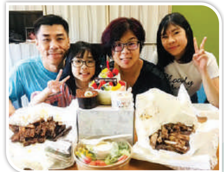
▲ GRC@Home - Canberra's very own "Eat with Your Family" Day!